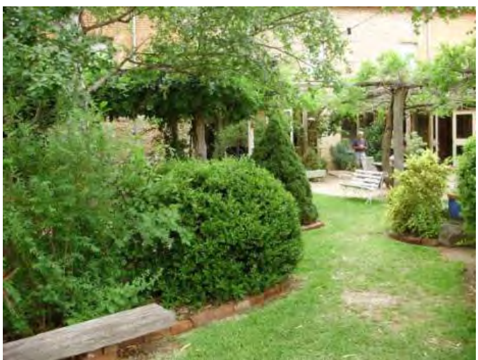
Private Summer Garden Setting