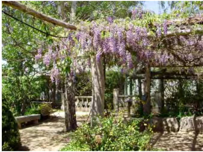
Private Spring Garden Setting